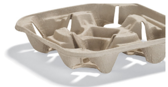
STRONGHOLDER 4-Hole Pulp Cup Carrier 8-32 oz #872966 2/150