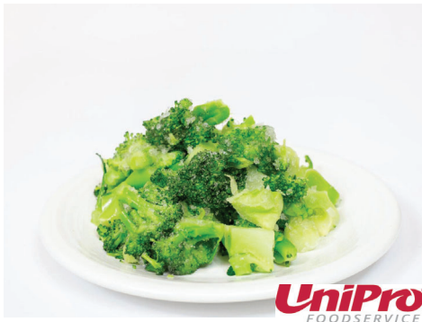
GARDEN FRESH Broccoli Cuts, Grade A, IQF #581664 1/20 lb