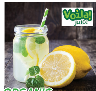
ORGANIC VOILA Organic Fresh Lemon Juice, Pasteurized #171721 4/1 gal

To Order, Please Contact Your BiRite Sales Rep