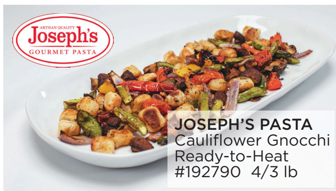
JOSEPH'S PASTA Cauliflower Gnocchi Ready-to-Heat #192790 4/3 lb