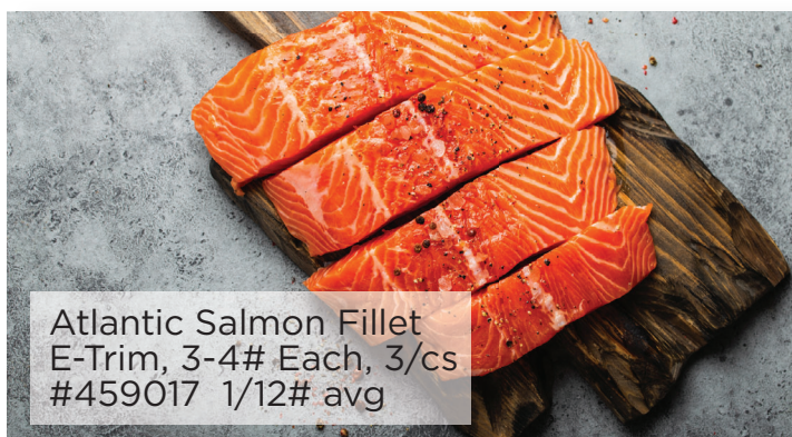
Atlantic Salmon Fillet E-Trim, 3-4# Each, 3/cs #459017 1/12# avg