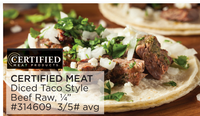
CERTIFIED MEAT PRODUCTS CERTIFIED MEAT Diced Taco Style Beef Raw, 1/4" #314609 3/5# avg