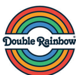
LOCAL VEGAN DOUBLE RAINBOW Soy Vanilla Bean Super Premium Ice Cream #171672 1/2.5 gal