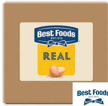
BEST FOODS Real Mayonnaise Deluxe BIB #185080 1/30 lb