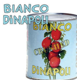
ORGANIC BIANCO DiNAPOLI Organic Crushed Tomatoes in Puree #543446 6/10