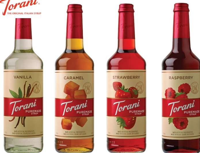
TORANI GMO-FREE Puremade Syrups (Glass) | 4/750 ml

#234519 | Vanilla #234524 | Strawberry #234520 | Caramel #234525 | Raspberry