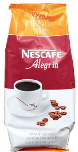
NESCAFÉ Alegria Freeze Dried Coffee ( dispenser use only )

#127004 | Decaf | 4/250 gr #127002 | Smooth | 3/400 gr