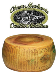
CUCINA ANDOLINA Parmesan Reggiano #94256 2/15# avg