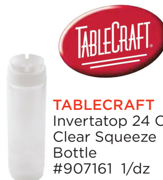
TABLECRAFT Invertatop 24 Oz Clear Squeeze Bottle #907161 1/dz