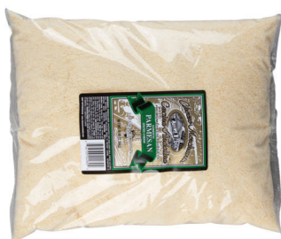
CUCINA ANDOLINA Grated Parmesan Romano Imported, Cellulose Added #94303 4/5 lb