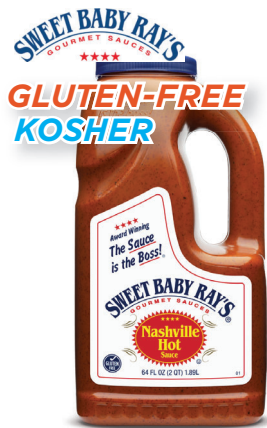
SWEET BABY RAY'S Nashville Hot Sauce Pourable, Ready To Use #133842 4/64 oz