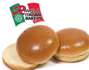
ROTELLA'S Brioche Hamburger Bun, Sliced 4.25" #10802 6/8 ct