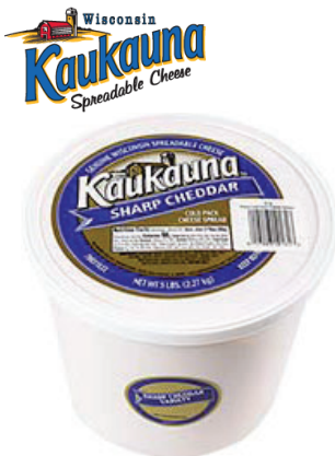
KAUKAUNA Sharp Cheddar Cheese Spread Ready-To-Use #91600 2/10 lb