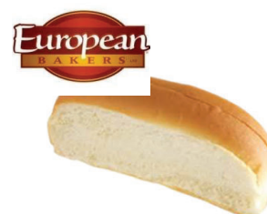
EUROPEAN BAKERS 6" New England Style Frank Bun, Top Sliced & Flat Sided #10803 12/8 ct