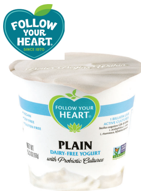
DAIRY-FREE FOLLOW UR HEART Plain, Dairy-Free Yogurt With Pro-biotic Cultures #171355 12/5.3 oz