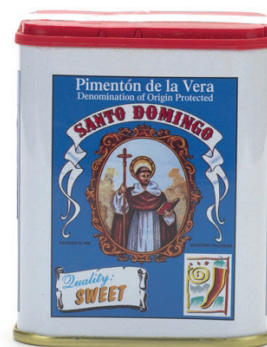
SANTO DOMINGO Smoked, Sweet Spanish Paprika de la Vera #517879 24/750 gr