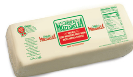
2% Part Skim Mozzarella Cheese Loaf