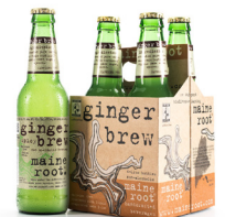
Ginger Beer Glass