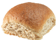
100% Whole Wheat Roll 8/24 Ct