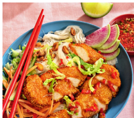
Breaded Veggie Chicken Tender, FC #403831 2/5 Lb