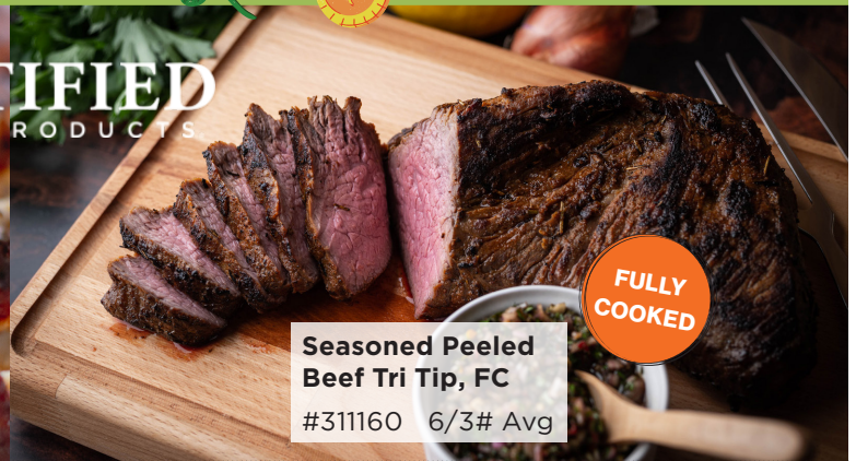
Seasoned Peeled Beef Tri Tip, FC #311160 6/3# Avg