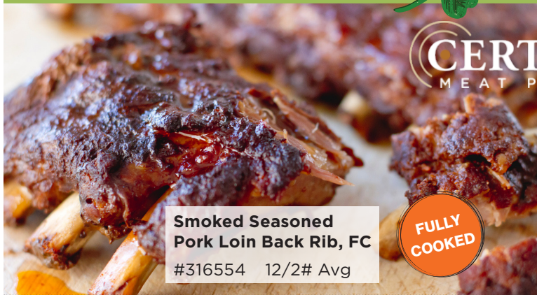
Smoked Seasoned Pork Loin Back Rib, FC #316554 12/2# Avg