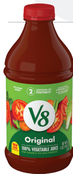
V8® Vegetable Juice 46 oz | 20808