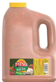
Pace® Medium Chunky Salsa 14170