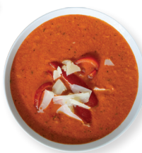
Reserve Roasted Red Pepper Tomato & Gouda Soup 16835