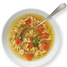
Signature Chicken Noodle 20303