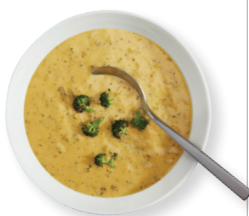
Signature Broccoli Cheddar 20301

ITALIAN Signature Italian Style Wedding Soup | 10428