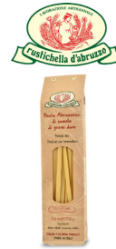
Pasta Fettuccine No Egg #3611 12/1.1 Lb