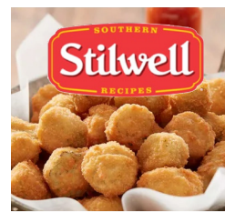
Heavy Breaded Cut Okra #340550 4/5 Lb