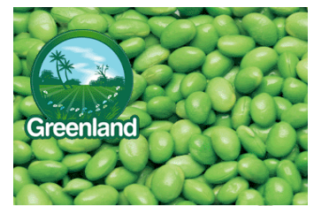
Shelled Edamame Beans, IQF #581116 1/20 Lb