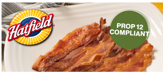
#319286 Bacon 14/18 Layout Applewood 1/15 Lb #316552 Pork Loin Back Rib 15/3#DN