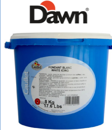
Fondant Icing France #3740 1/17.6 Lb