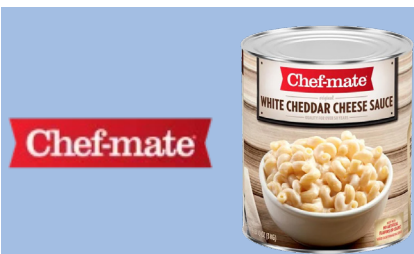
Sauce White Cheddar Cheese #423020 6/106 Oz