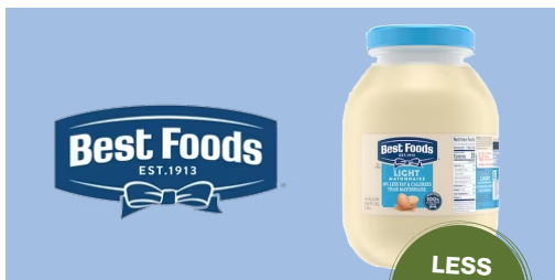
60% Light Mayonnaise #185075 4/1 Gal