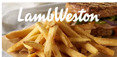
Potato French Fries | 6/5 Lb #586067 5/16 Crispy, Thin Regular Cut #586007 3/8 Simple Recipe