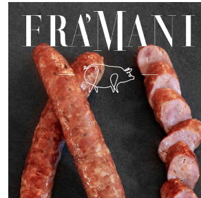
Sausage Breakfast Link 1.5 Oz, FC #318062 8/8.5 Oz