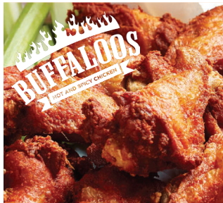
Chicken Wings Spicy 1/2nd Joint, FC #403012 2/4.5 Lb