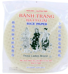
Rice Paper 11 in. Springrolls #3224 44/12 Oz