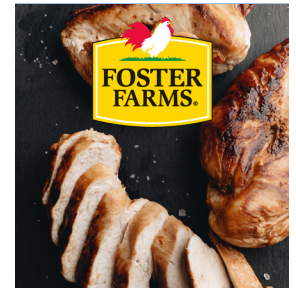
Chicken Breast B/S, 5 Oz, NAE, CVP #407090 2/10 Lb