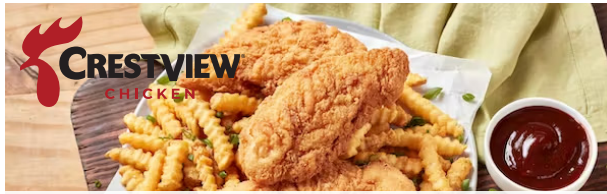
#400432 Chicken Tender Fritter Southern Style Par Cooked 2/5 Lb #404517 Chicken Wing Breaded 1/2nd Joint Mild FC 3/5 Lb #404530 Chicken Wing Breaded 1/2nd Joint Spicy FC 3/5 Lb