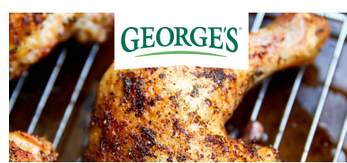
GEORGES Fresh Chicken Leg Quarter, Bulk #402365 4/10 Lb