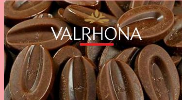
VALRHONA 62% Dark Satilia Chocolate #3035 1/26.5 Lb