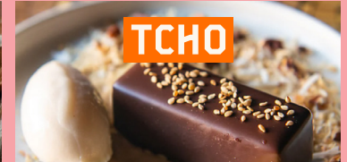
TCHO 70% Real Fudgy Dark Chocolate #3090 1/3 Kg