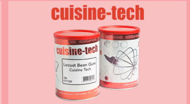
cuisine-tech Locust Bean Gum #3226 1/16 Oz