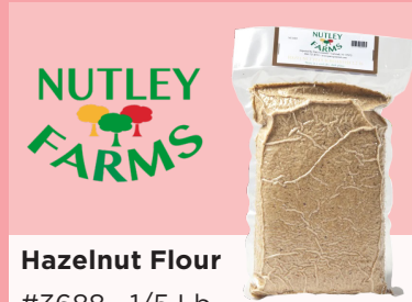
NUTLEY FARMS Hazelnut Flour #3688 1/5 Lb