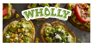
WHOLLY Fresh Hand-Scooped Avocado #190240 8/2 Lb

TO ORDER, PLEASE CONTACT YOUR BIRITE SALES REPRESENTATIVE 123 SOUTH HILL DRIVE, BRISBANE, CA 94005 | TEL: (415) 656 - 0187 | WWW.BIRITE.COM