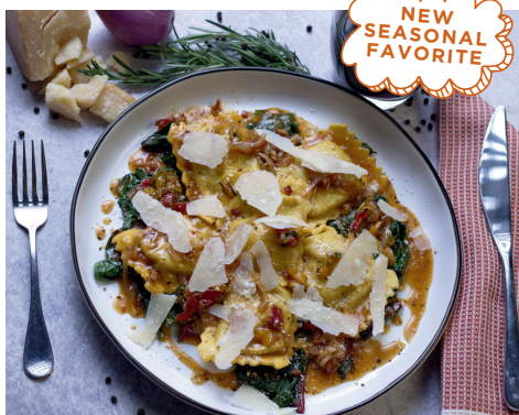
Veal Osso Buco Gold Ravioli #192700 | 2/3 Lb

Milanese-style Veal Osso Buco with Parmesan cheese, Chianti wine, saffron, gremolata and an assortment of vegetables; wrapped in par cooked, high egg content pasta.