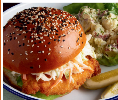
Rustic 4" Tuxedo Bun w/Black & White Sesame Seeds Sliced #10686 | 3/12 Ct

Artisan-quality brioche hamburger bun made with real butter, cage-free eggs, and milk, and fermented for 24 hours to yield a robust flavor and superior structure.