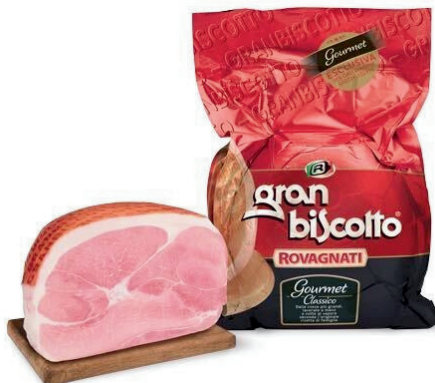
Gran Biscotto Cooked Ham #319346 | 2/14.7# Avg

Gran Biscotto is a classic prosciutto cotto (cooked ham), made from high-quality pork and served in thin slices. Pair with cheeses, nuts, and honey for your next antipasto board, or enjoy on fresh focaccia as a simple panino.