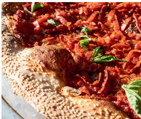
Ribbon Pepperoni #318781 | 2/5 Lb

This shredded pepperoni is made from select pork and beef cuts. It has a bold flavor with extra garlic, black & cayenne pepper, and paprika. It allows for full coverage in a fraction of the time and pepperoni in every bite.