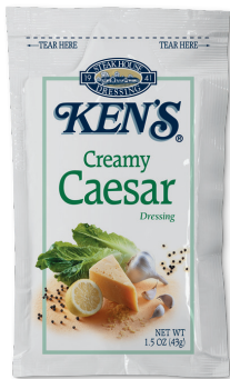
Creamy Caesar Dressing, Individual Pouch #282610 | 60/1.5 Oz

Ken's Caesar Dressing offers a rich, creamy flavor with anchovy, garlic, and Romano. It's conveniently portioned for side salads and self-serve cafeterias, making it suitable for to-go and delivery.