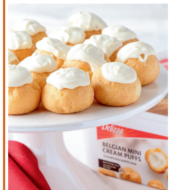
Mini Belgium Cream Puff #11625 | 6/3.3 Lb

Crafted from their time-honored Belgian recipe, they use only the finest ingredients, including fresh whipped cream.