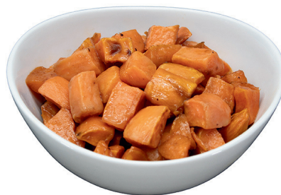
Roasted Sweet Potato, Diced #585099 | 6/2.5 Lb

Discover the FLAV-R-PAC® Fire Roasted Collection, made with their unique roasting process and special seasonings for the on-trend tastes and visual appeal customers crave.