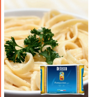
Fettuccine, Italy #384931 | 4/5 Lb

Fettuccine is versatile and pairs well with various sauces. It is especially recommended for tomato and meat ragù, as well as fish-based sauces, particularly shellfish.