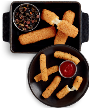
Battered Mozzarella Stick, 2.75" #343636 | 6/2 Lb Italian Style Breaded Mozzarella Stick, 3.25" #343635 | 4/3 Lb Anchor Cheese Sticks are perfect for dipping.