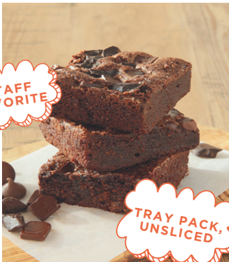
Fabulous Chocolate Chunk Brownie #11043 | 4/2.8 Lb

A buttery chocolate, chewy Brownie generously studded with milk chocolate drops, bittersweet & semi-sweet chocolate chunks.