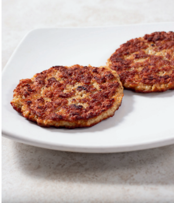
2 Oz Sausage Patty, 3", Precooked #318043 | 2/5 Lb

Rangeline sausage is made with fresh pork trimmings, never fillers or binders, and flavored with a proprietary spice blend.