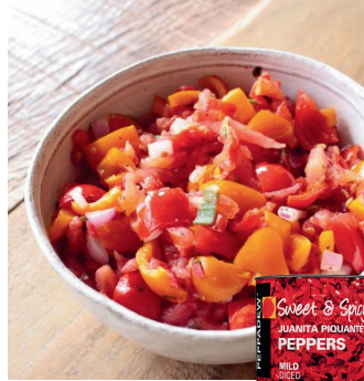
Diced Peppadew Peppers #378422 | 2/6.6 Lb

Unique South African peppers with a distinctive sweet-to-spicy flavor and crisp texture that awakens the palate. The marinade is a perfect ingredient for dressings and stir-fry.