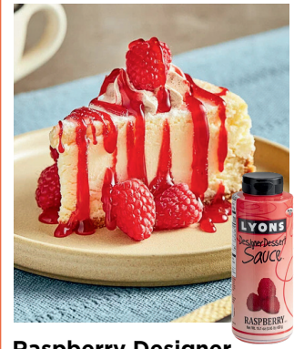
Raspberry Designer Dessert Sauce #234810 | 12/15.1 Oz

The "fresh-picked" flavor is conveniently packed in an easy-to-squeeze bottle for effortless drizzling. It's perfect for ice cream, frozen yogurt, smoothies, and more!