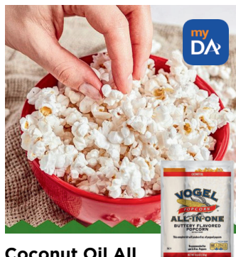
Coconut Oil All in One Popcorn Kit #578610 | 24/10.6 Oz

Vogel Coconut Oil Butter-Flavored Popcorn is a tasty snack enjoyed by both kids and adults. It is kosher certified, catering to those with special dietary needs.