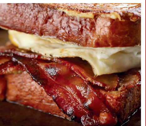
Bacon, Precooked, 300 Slices #319253 | 2/150 Ct

Diced Bacon Topping, .5", Precooked #319302 | 2/5 Lb