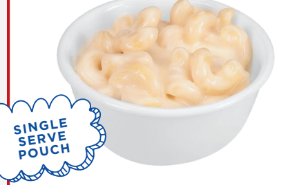
White Cheddar Mac & Cheese #192216 | 36/7 Oz

From the #1 mac & cheese brand with over 85 years of experience, each single-serve pouch is designed for quick preparation and reduced waste. It's made with al dente Cavatappi pasta, for the perfect bite, and creamy white cheddar cheese sauce.